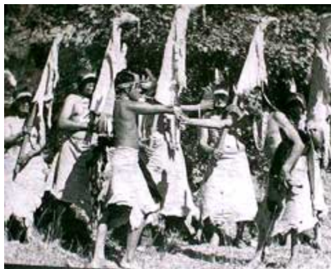
The White Deer Dance was (and is) an important spiritual ceremony for Native Americans on the Redwood Coast.

2004 - City of Eureka cedes large portion of Indian Island back to Wiyot people.